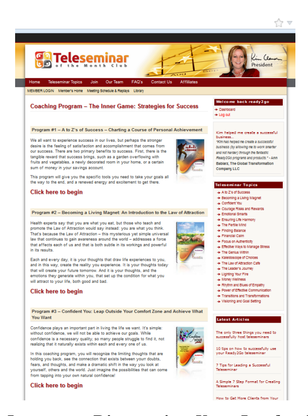
The Leader's Journey – Discovering Your Leadership Impact Self-Study Coaching Program Preview